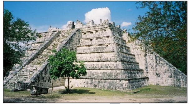
El Osario Pyramid, Chichén Itzá, Mexico

Example 3: A pyramid at Chichén Itzá in Mexico contains several layers that are in the shape of square prisms. The first layer has a side length of 50 meters and each successive layer has a side length that is 95% of the one directly below it. What function can be used to find the side length, in meters, of layer L , where 1 \leq L \leq 6 ?